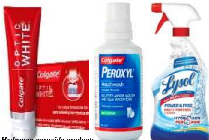
Hydrogen peroxide products

This leaves us with Hydrogen Peroxide (H 2 O 2 ), number four on the list, just below ozone, hydrogen peroxide is a compound of two parts hydrogen and two parts oxygen (2) , simply water (H 2 O) with one extra atom of oxygen. Sounds safe enough! Hydrogen Peroxide has been used by the medical community for 170 years, mostly for disinfection purposes. In the 1920s, the British cut the mortality rate for pneumonia from 80% to 48% using Hydrogen Peroxide therapy. Hydrogen Peroxide (H 2 O 2 ) is considered the safest oxidizer available (after oxygen). It is widely used today in toothpaste, mouthwash and household